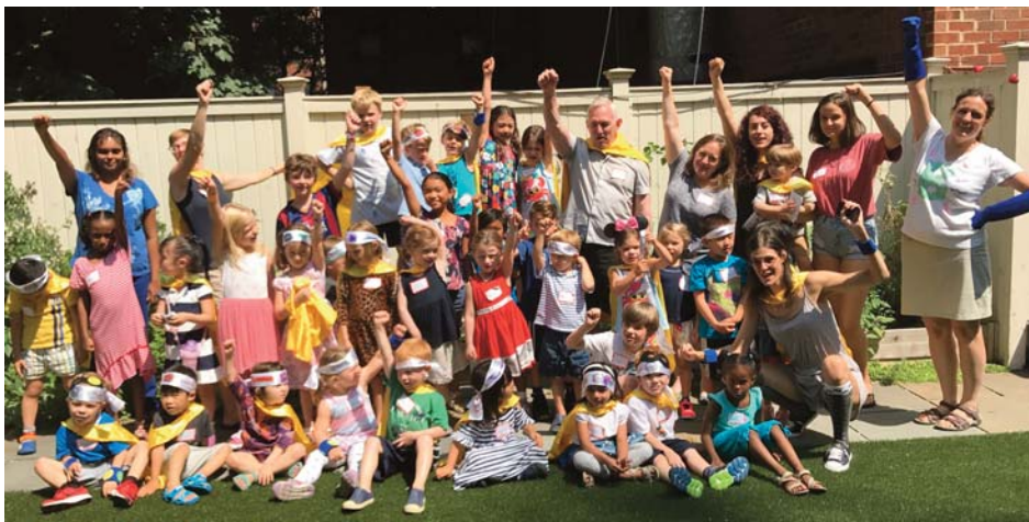
The entire group in superhero pose!